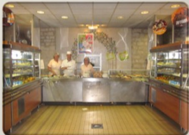
A typical school canteen