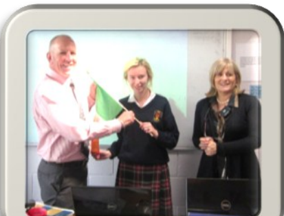
Presented with an Irish flag St Joseph's, Dublin