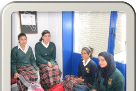
Muslim Students at Notre Dame High School, Glasgow